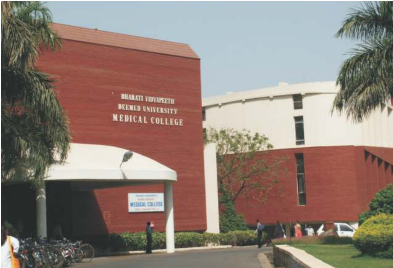
MEDICAL COLLEGE, PUNE