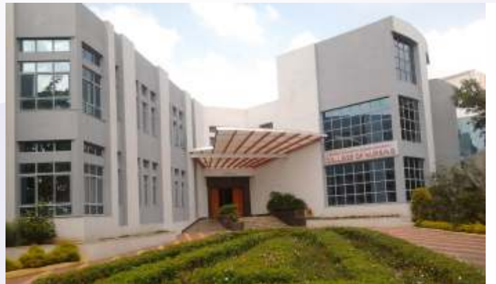
College of Nursing, Sangli