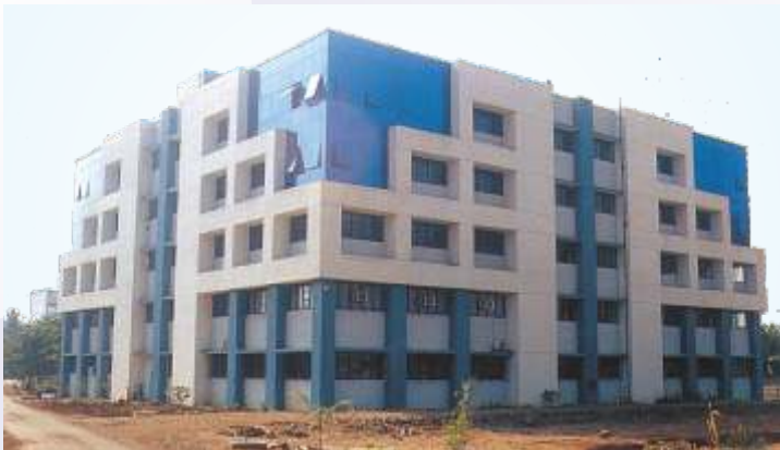
College of Nursing, Navi Mumbai