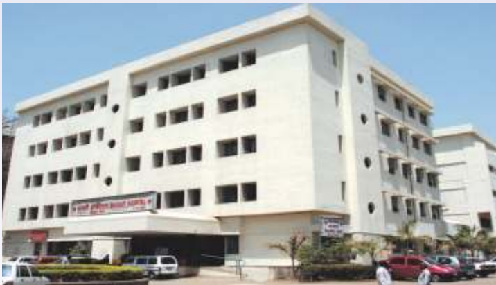
Bharati Hospital, Pune