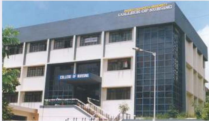
College of Nursing, Pune