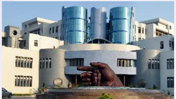
Bharati Hospital, Sangli