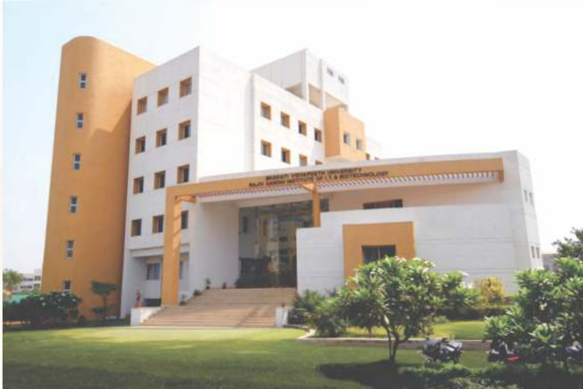
Rajiv Gandhi Institute of I. T. & Biotechnology